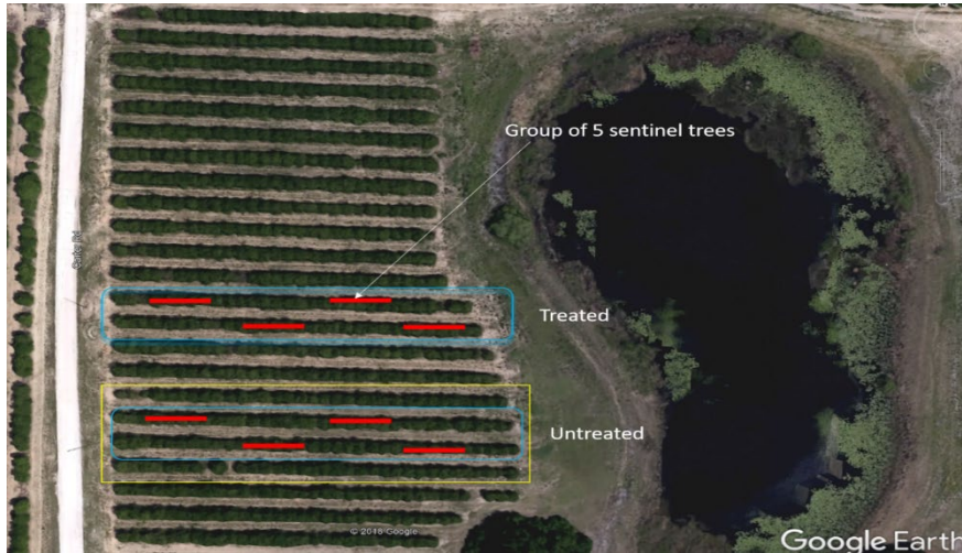
Figure 1. Treatment layout options