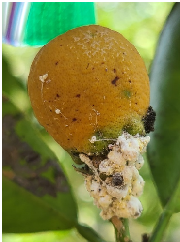
Infested citrus fruit