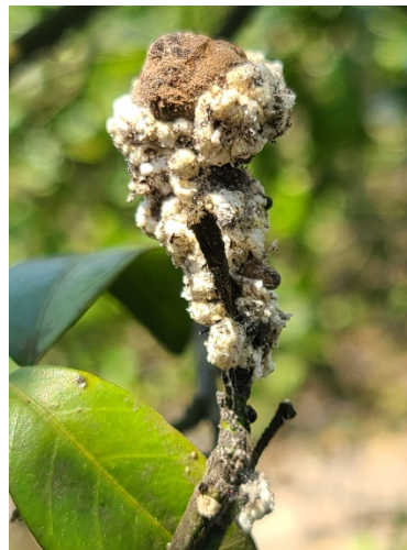
Same fruit after 2 weeks